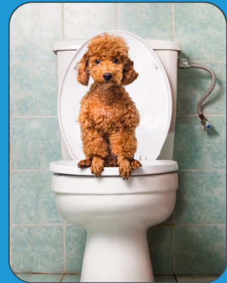
Dogs can't do this....